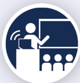
DIGITALLY EMPOWERED CLASSROOM