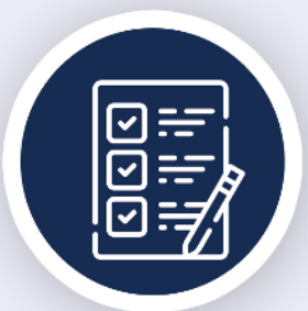
CONCEPT WISE PRACTICE TEST