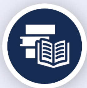
UNIQUE INNOVATIVE STUDY MATERIALS