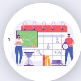
PERSONALIZED STUDY PLANS