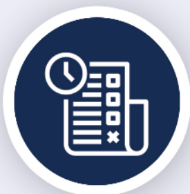
WEEKLY MOCK TEST