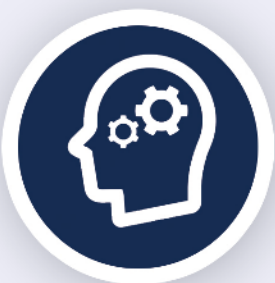
MEMORY BASED TRAINING