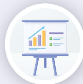
3D PRESENTATION OF CONCEPTS